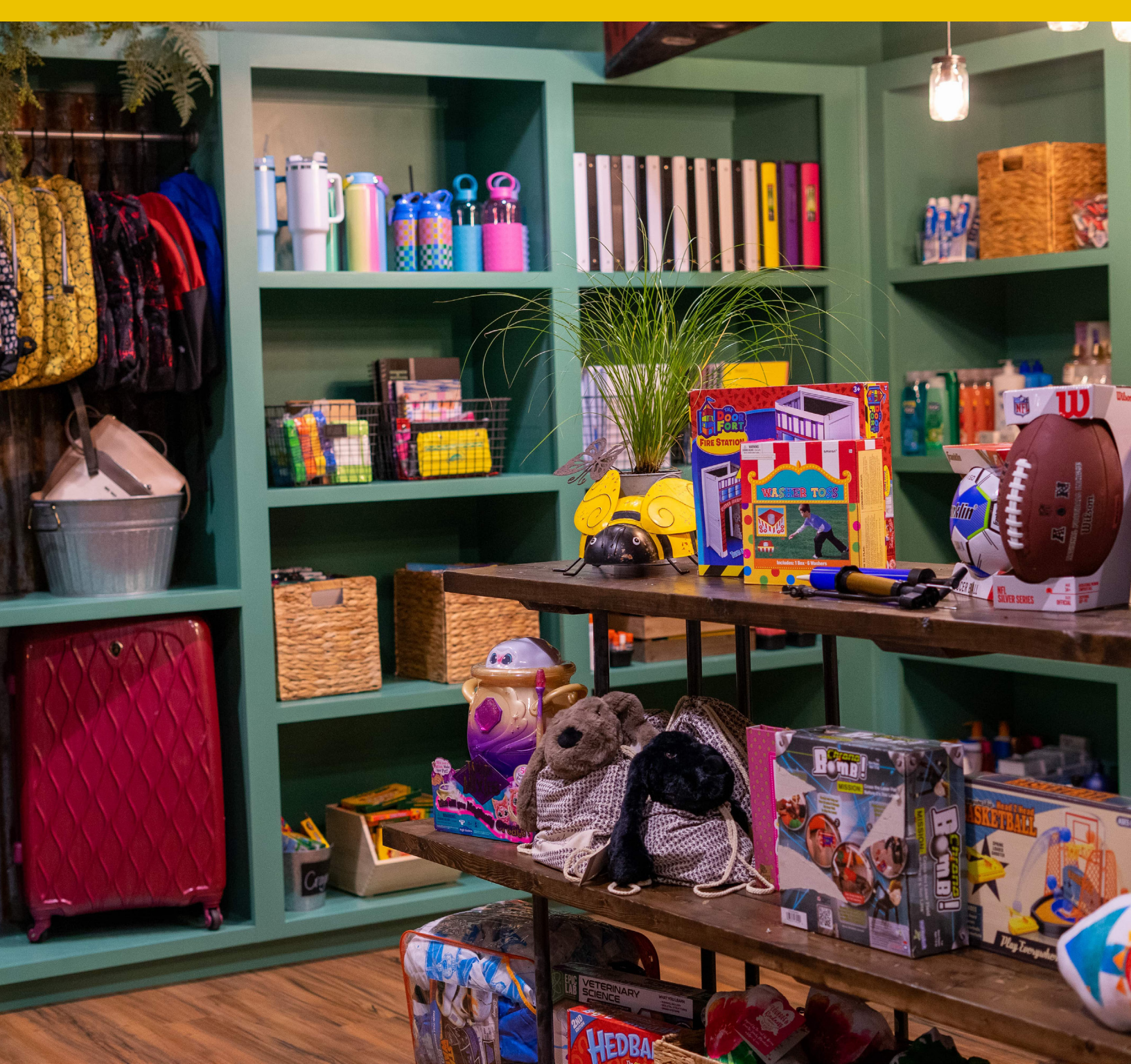
Bloom Closet | Rome, GA