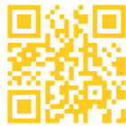
Donate to Our Mission