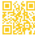
Foster a Child